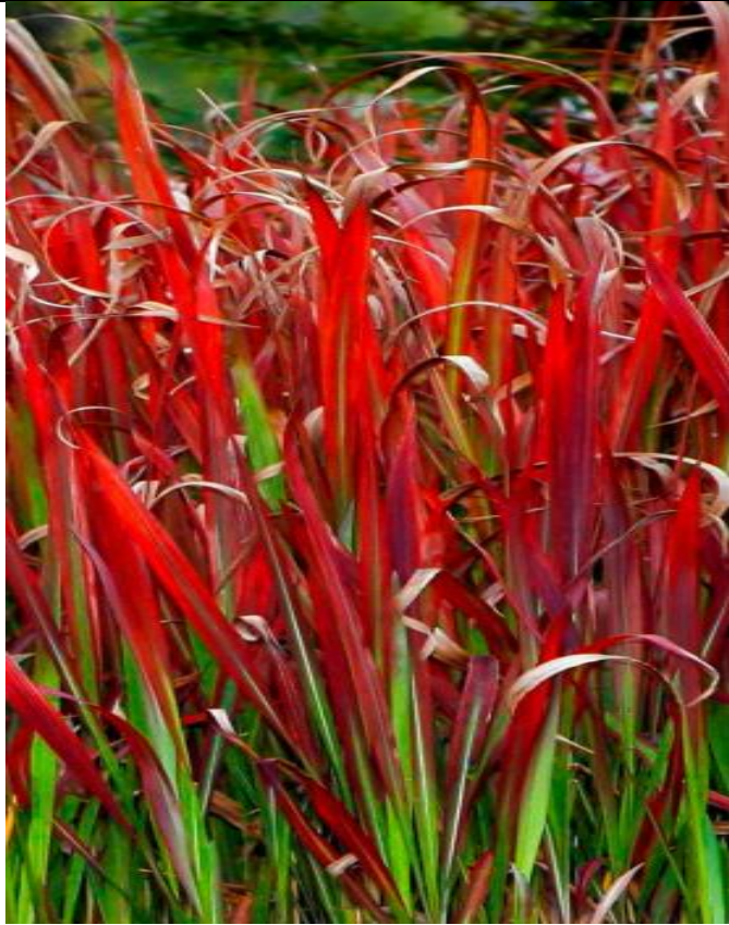
Imperial Red Baron