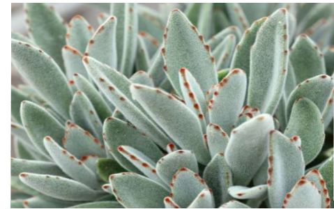
Kalanchoe Tomentosa also known as pussy ears or panda plant, is a succulent plant