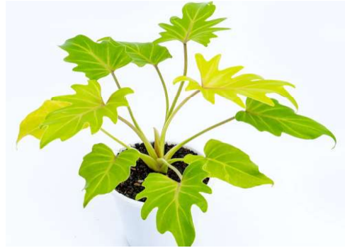
Philodendron Xanadu Golden