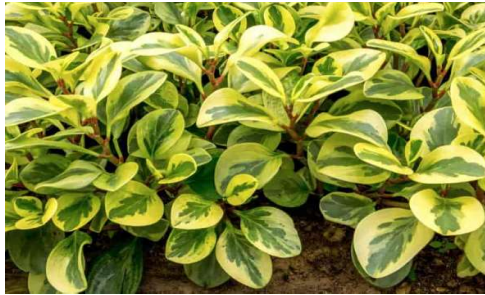
Peperomia Obtusifolia var highly variegated leaves with splashes of cream and sage green