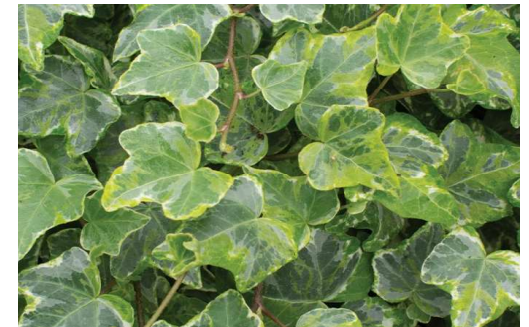
Hedera Mint kolibri Color: •Leaf color: Green •Growth Habit:climbing