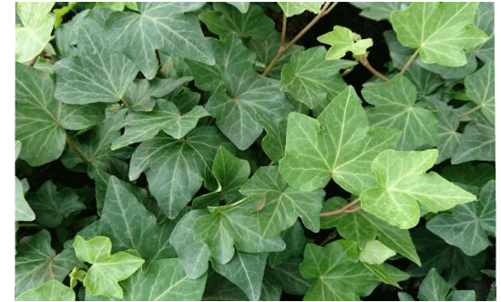
Hedera Green Brigitte attractive, dark-green ivy that is suitable for hanging baskets and other containers