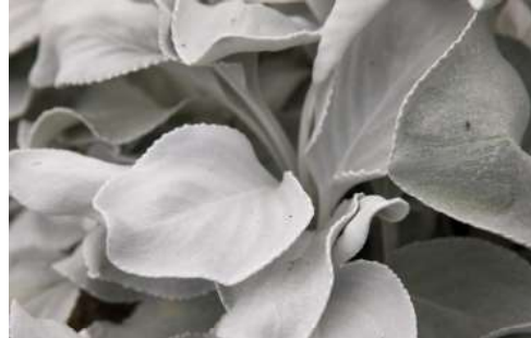
Senecio Cardicans Angel Wings