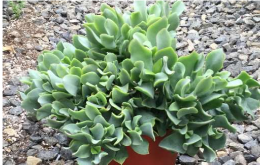
Crassula Arborescens •blue-grey foliage