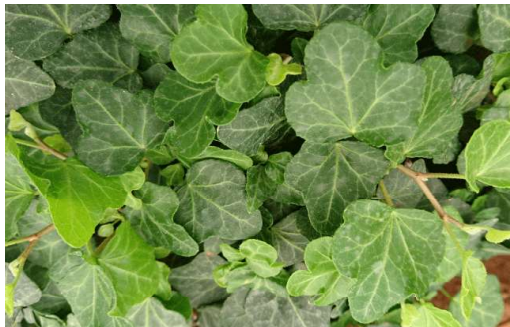
Hedera Green Mini Wonder dark green ivy with rosette-shaped leaves