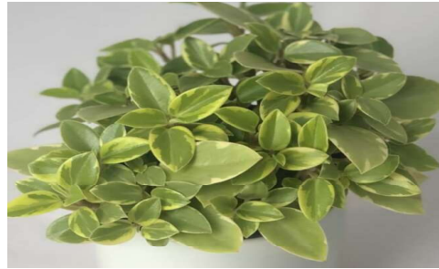
Peperomia Orba Pixie Lime semi-succulent, so it grows best in light, well-draining soil and prefers full sun- light and warm temperatures