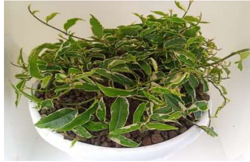
Ficus Variegata A non strangling fig which may reach 30 metres in height. The tree is evergreen when young but becomes briefly deciduous as it grows older