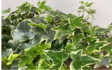
Hedera var. Eva •Color: •Leaf color:Green •Growth Habit:climbing