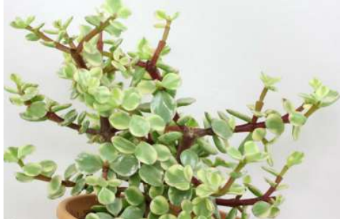
Portulacaria Afra Variegata