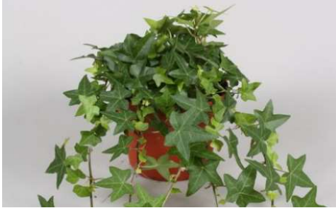
Hedera Green Pittsburg •Highly versatile. •Evergreen Vine. •Small to medium deep green and glossy leaves. •Ground cover. Habit:climbing