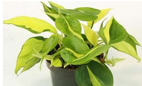
Philodendron Oxycardium Brazil •blotched yellow and green, heart-shaped leaves, each with a pointed tip •stems are pink when young