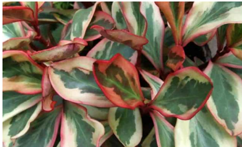
Peperomia Clusiifolia var is a new variation of Peperomia in the Piperaceae family