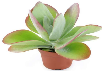
Kalanchoe Thrysiflora very drought tolerant plant, but wrinkly, shriveled leaves are a sign that it's gone too long without a drink