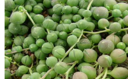
Senecio Sea Pearls