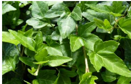
Hedera Green Shamrock Is an evergreen trailer or climber with small, dark green leaves consisting of a large central lobe and two smaller side lobes