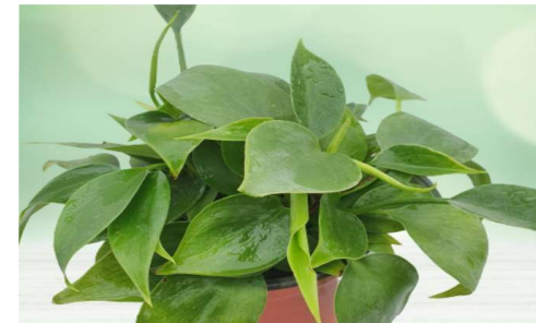
Philodendron Oxycardium Green known for its air-purifying properties. It efficiently removes common indoor pollutants like formaldehyde, xylene, and toluene