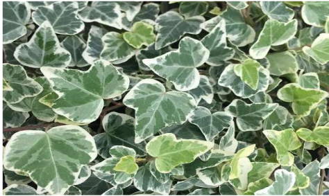
Hedera var. white Wonder •Color: •Leaf color:Green •Growth Habit:climbing