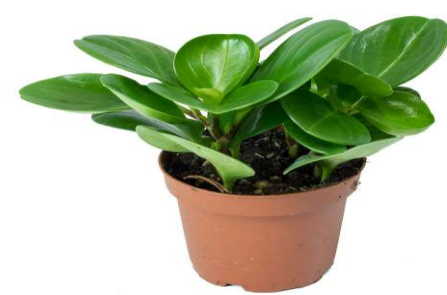
Peperomia Obtusifolia Green is a bushy, upright plant with thick stems and fleshy, glossy, cupped leaves