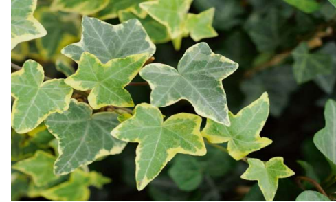
Hedera Gold child •Leaf color:Green •Growth Habit:climbing