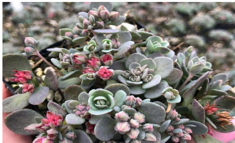
Sedum sunsparkler Blue Elf clusters of fragrant dark pink flowers appear in late summer to early fall