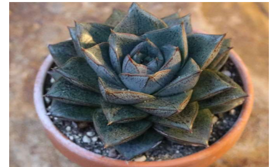
Echeveria Purpusorum •Develops pointy leaves, and the whole plant grows into something resembling a fully bloomed rose flower pattern