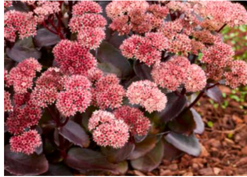
Sedum Black Night glossy, black foliage and red flowers in August-September