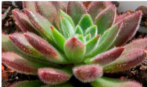
Echeveria X set oliver