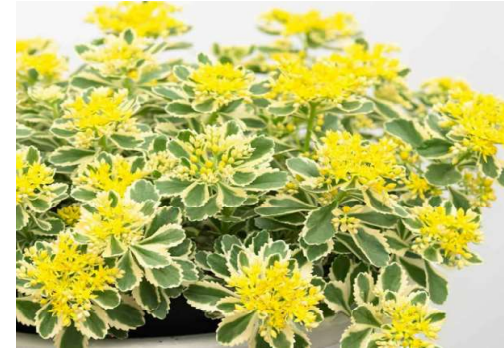
Sedum Atlantis Low, spreading sedums form a solid mat of foliage which is excellent for covering slopes or can be planted as a groundcover