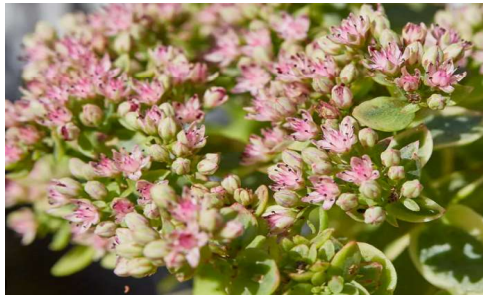
Sedum Sunsparkler Lime Twister Sitting atop short, upright stems, clusters of small, soft pink, starry flowers appear in late summer to early fall