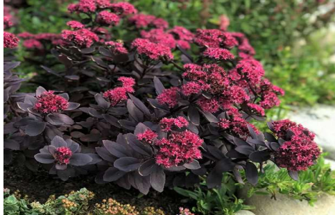
Sedum sunsparkler Plum Dazzled Upright stems, clusters of large, cherry, starry flowers appear in late summer to early fall