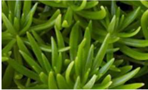
Sedum Lemon ball Vivid mounds of chartreuse foliage stay dense, bushy and bright all Summer long