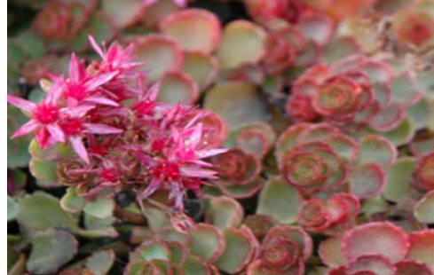
Sedum Schorbuser blut red stems of toothed mid-green leaves, glowing red when mature