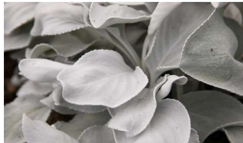
Senecio Candicans Angel wings new, unusual and eye-catching evergreen perennial with huge silvery or grey-white leaves