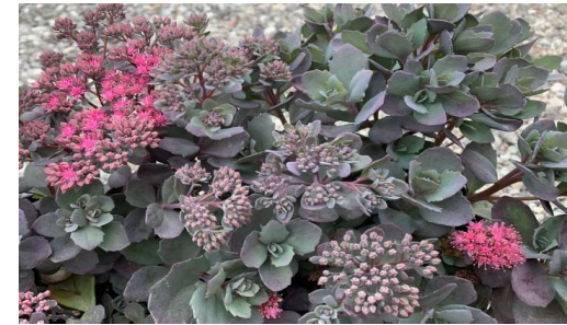
Sedum Sunsparkler Dazzle Berry mat-forming perennial with an abundance of succulent-like blue-gray leaves that retain their color all season long