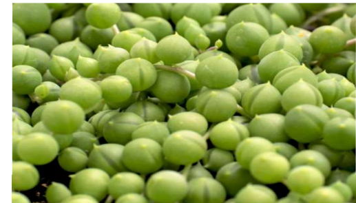
senecio Sea pearls String of Beads is a delicate hanging succulent that thrives in warm and dry environment.