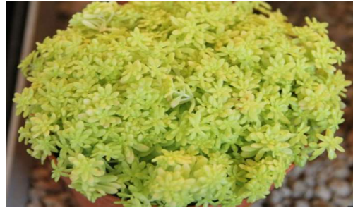
Sedum Japonicum Tokyo Sun pops bright yellow. It is only hardy to about 10F (zone 8) but it is an eye-catching accent in pots