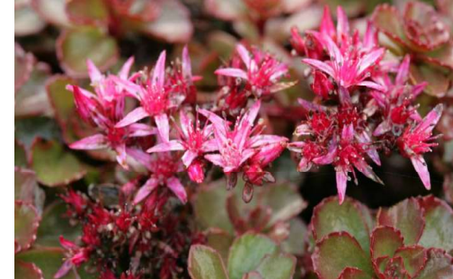
Sedum Fuldagut sprawling, mat-forming, semi-evergreen perennial with fleshy, rounded, dark bronze-red leaves