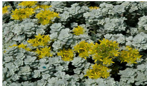
Sedum Spath Cape Blanco Attractive to butterflies, clusters of bright yellow starry flowers appear atop short, thick stems in summer