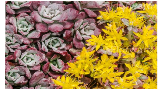
Sedum Spath Purpureum purple leaves which turn particularly dark in the winter. Bright yellow flowers are produced in late spring and early summer on short stems up to 4 inches high