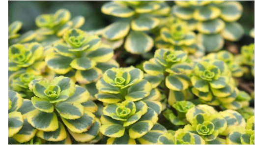
Sedum little Gecko A hardy succulent groundcover with excellent and consistent variegated foliage. Summer brings clusters of pink flowers