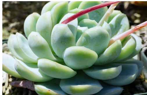
Echeveria Elegans •tight rosettes of pale green-blue fleshy leaves • long slender pink stalks of pink flowers with yellow tips in winter and spring