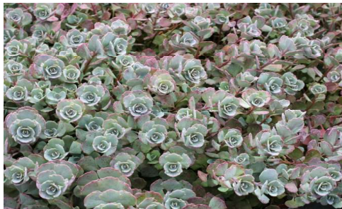
Sedum Lidakense spreads by underground stolons, slowly forming spreading mats. It is the perfect sedum to tuck into a rockery