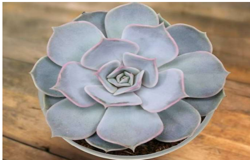
Echeveria Lilacina •The leaves are silvery-grey, spoon shaped, fleshy and arranged in a symmetrical rosette •Flowers are pale pink or coral-colored