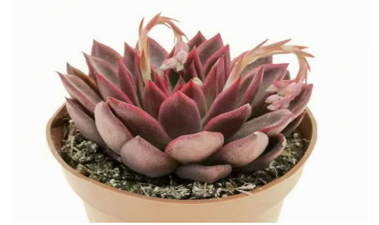
Echeveria Rubra fast growing and a hardy rosette-forming, grey-leafed