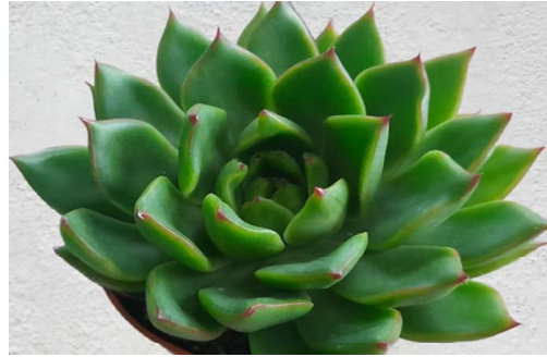
Echeveria Lipstick •green rosette with pointed leaves lined with crimson