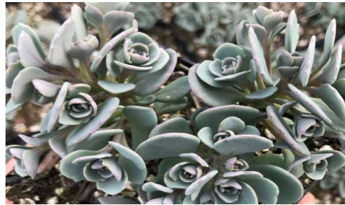
Sedum Cauticola low growing, carpet-forming, succulent perennial with trailing stems bearing rounded, pink-tinged gray-green leaves