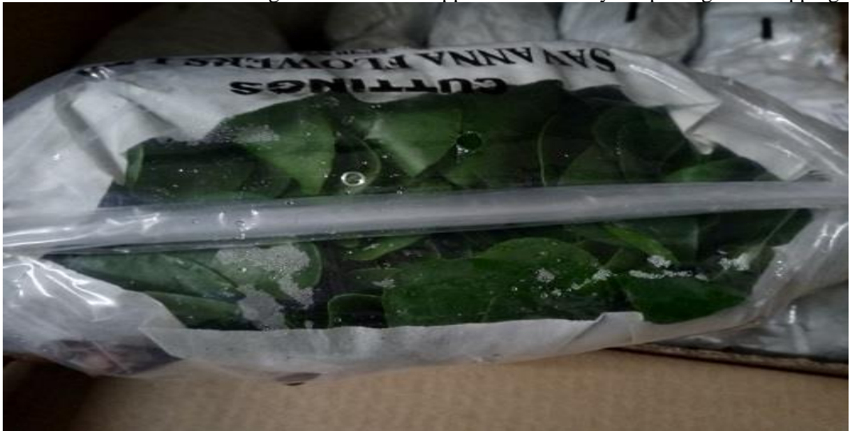
This image showcases cuttings in a bag properly packaged