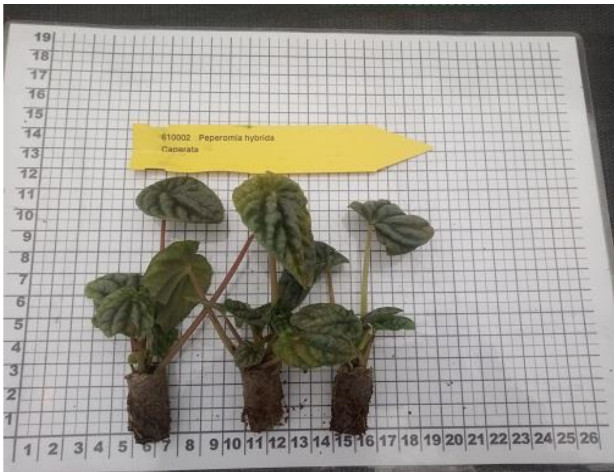
The two images showcase the various plugs for rooted plants and their sizes