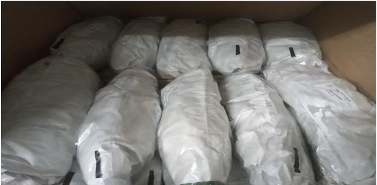
This showcases the unrooted cuttings that are to be shipped and how they are packaged in shipping boxes