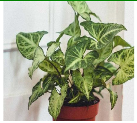
Syngonium White Butterfly